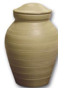
Eco-Friendly Natural Earth $173