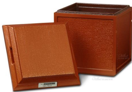
Wilbert Urn Vaults